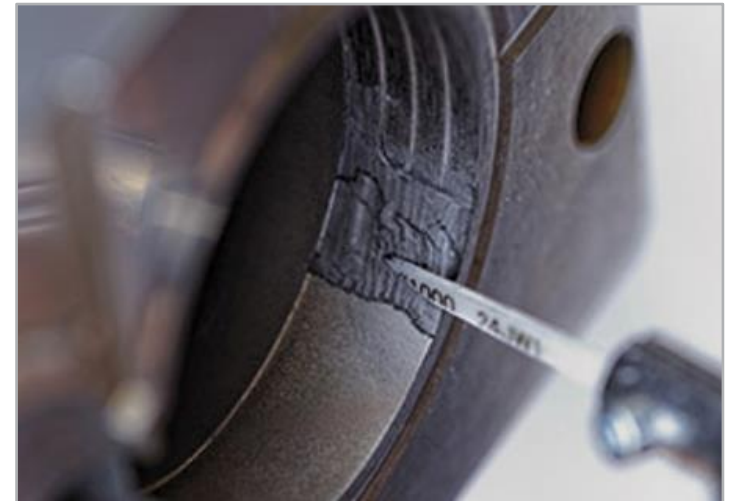
Input quality control