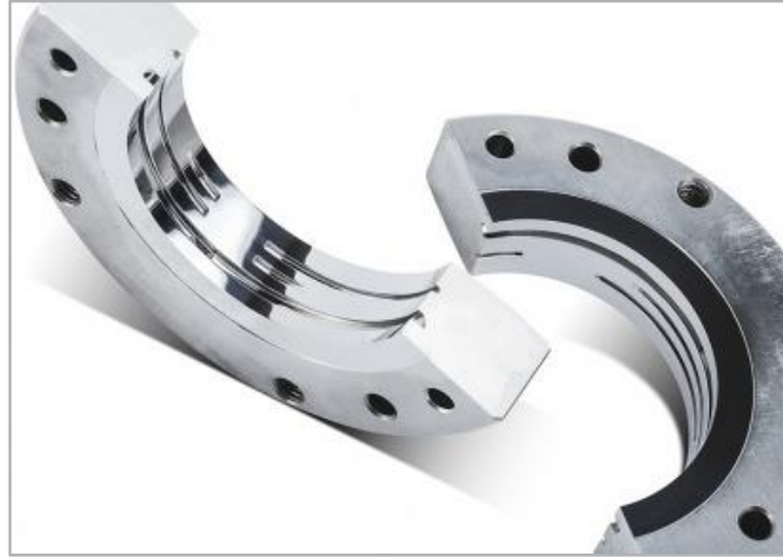
Mirror polishing of tiny cavities