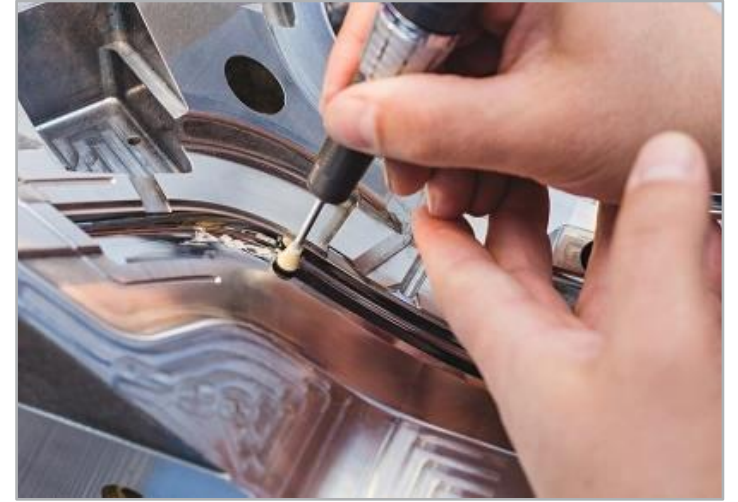
Mirror polishing of headlight mould