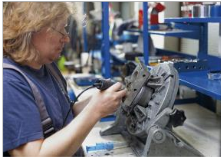
Mirror polishing of mould insert